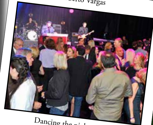
Dancing the night away