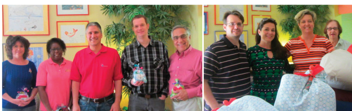
PBC Property Appraiser's Office