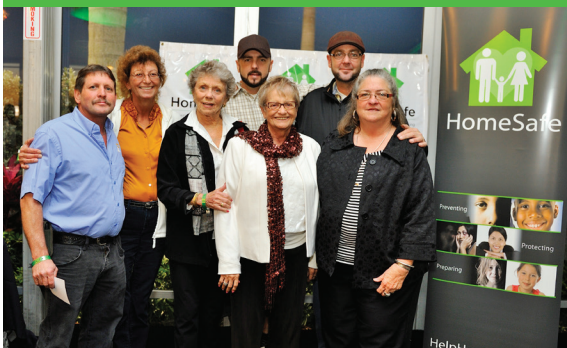
Fraternal Order of Eagles