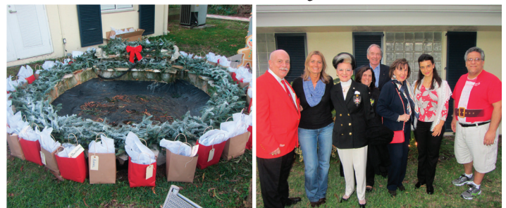
Holiday Party on the lawn hosted by the Order of St. John of Jerusalem Knights Hospitalier