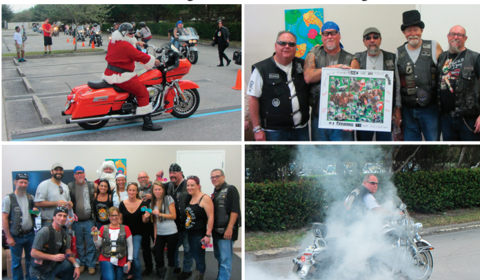
Alternative Motorcycle Club Holiday Party

Thanks to the generosity of many wonderful donors, HomeSafe children and families had lots to celebrate this holiday season!