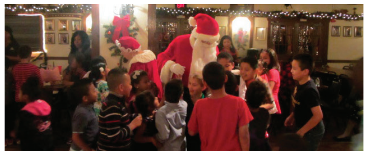
SafetyNet holiday party