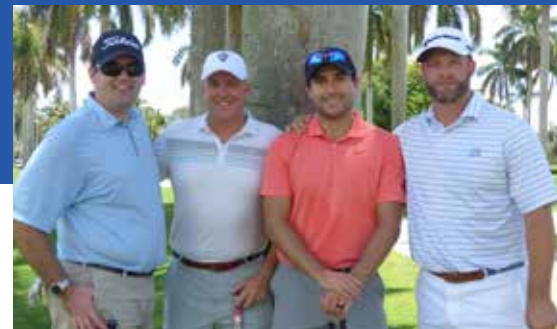
The TD Bank team placed first in the men's division