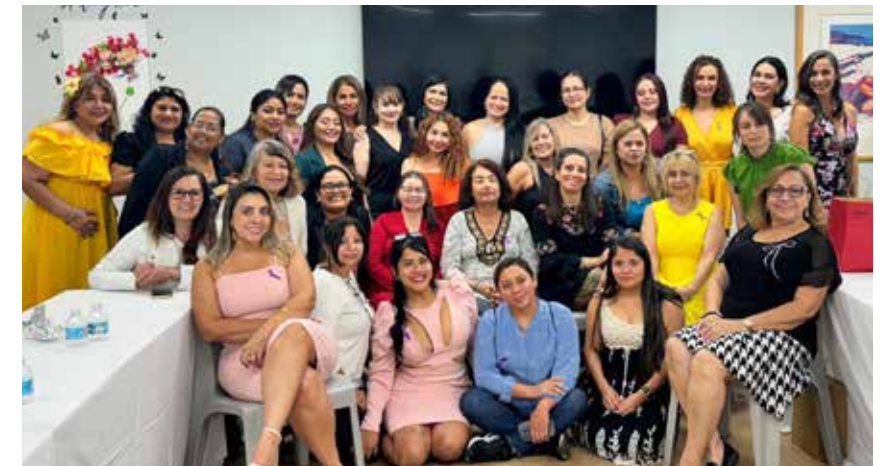
The ladies who enjoyed the day of beauty, empowerment and gratitude.

I want to thank HomeSafe and all those who collaborate with the agency so that survivors of domestic violence can see another outlook of our lives. The only thing we have to do is recognize that we have a problem which we need help to overcome. When they offered me help, I hesitated a lot to accept, since my self-esteem was very damaged. I felt ashamed and could not accept that I had suffered from violence; but today I consider that it was my biggest and best decision in life, since today I feel empowered.