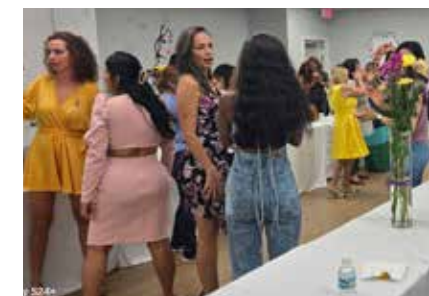
Throughout the day, attendees participated in activities that allowed them to support each other, celebrate their successes, and even get motivated with some Zumba moves!