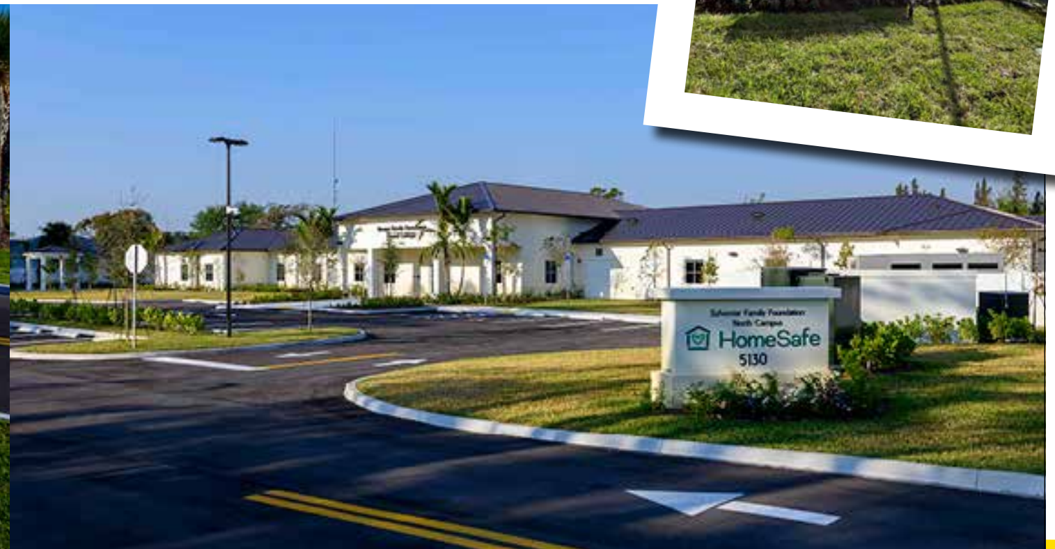
Above: Sylvester Family Foundation North Campus in West Palm Beach – Opened 2023 Above Right: Bernstein Family Foundation Campus in Boca Raton – Opening December 2024