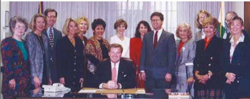
Community members at the original opening of HomeSafe's Boca campus.

It is through your generous support that HomeSafe is able to significantly enhance and expand its programming to better serve the most vulnerable in our community.