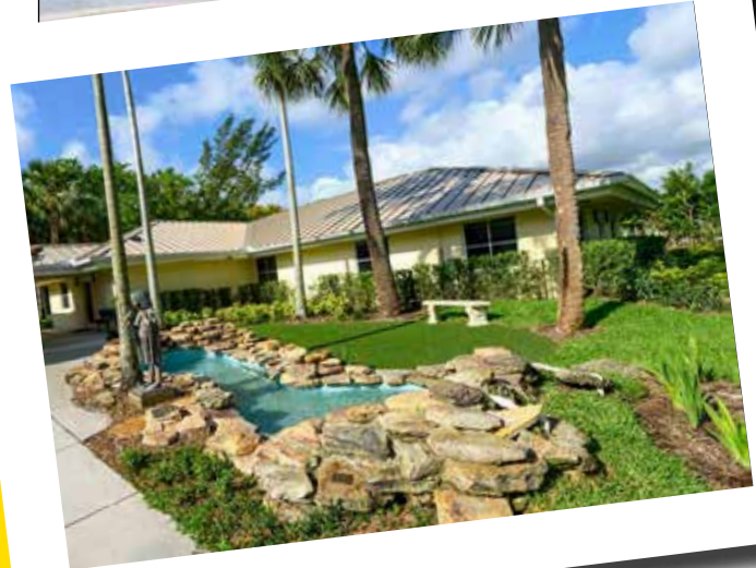
Above: Sylvester Family Foundation West Campus in West Palm Beach – Opened 2021 Left: Simon C. Fireman Campus in Lake Worth – Re-opened 2022